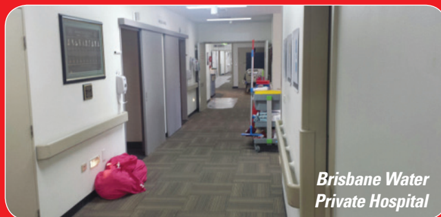
Brisbane Water Private Hospital