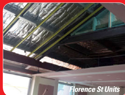
Florence St Units