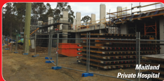
Maitland Private Hospital